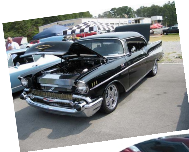
Best of Show Eddie & Glenda Barrow 1957 Chevrolet