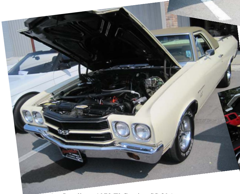
Art Sevelius - 1970 El Camino SS 396